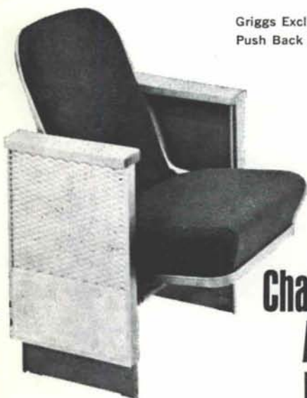
Griggs Exclusive Push Back Chairs