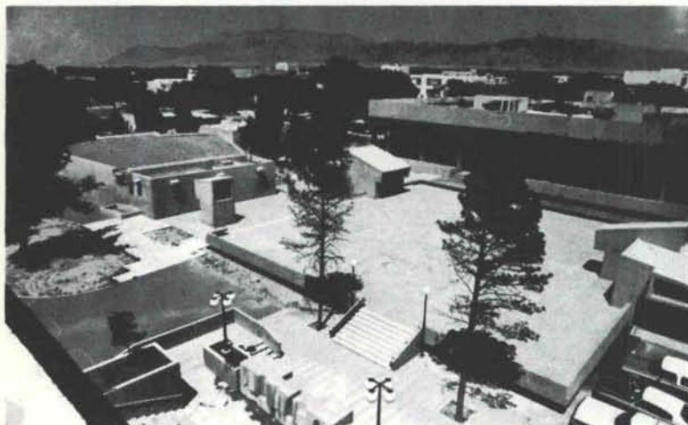
Physics Laboratories and Lecture Hall on the University of New Mexico Campus