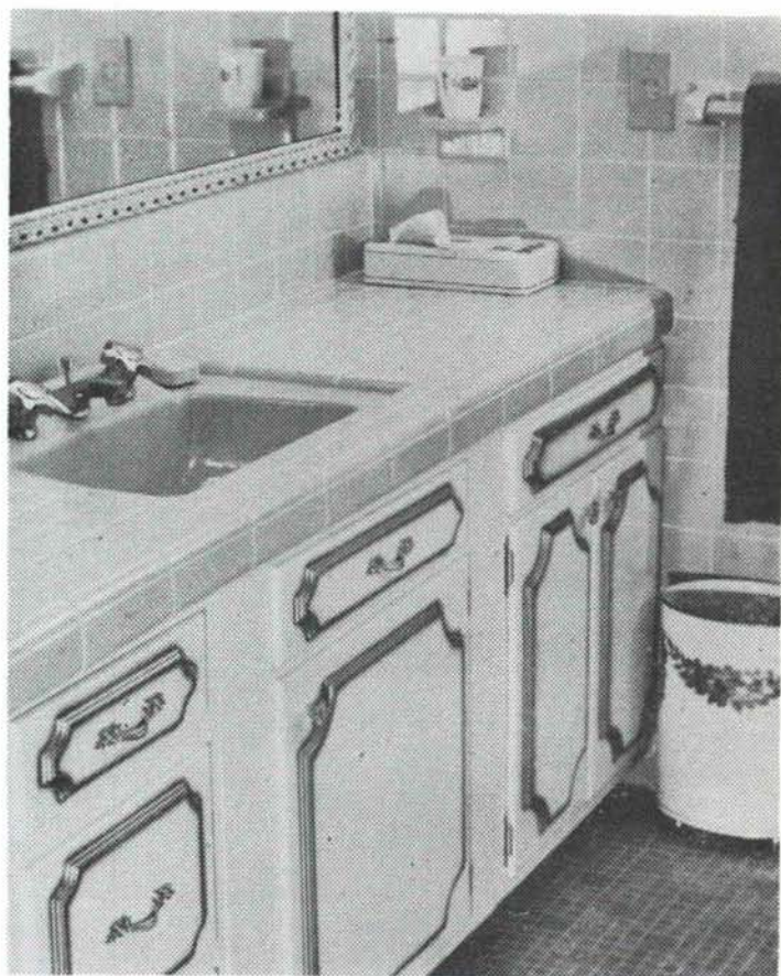
BELOW—One of a number of Monarch Tile installations in the new underground residence in Plainview.

MONARCH TILE MANUFACTURING, INC., FACTORY AND GENERAL OFFICE, SAN ANGELO, TEXAS Member, Tile Council of America • Factory Branches in Five Cities • Showrooms and Warehouses in 16 Cities New Mexico office: 414 Second St. S.W., Albuquerque, N. M.