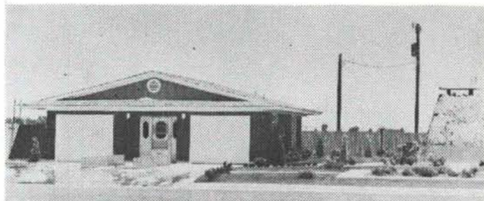
ABOVE—Above ground entrance to the new underground residence and fallout shelter in Plainview, Texas.