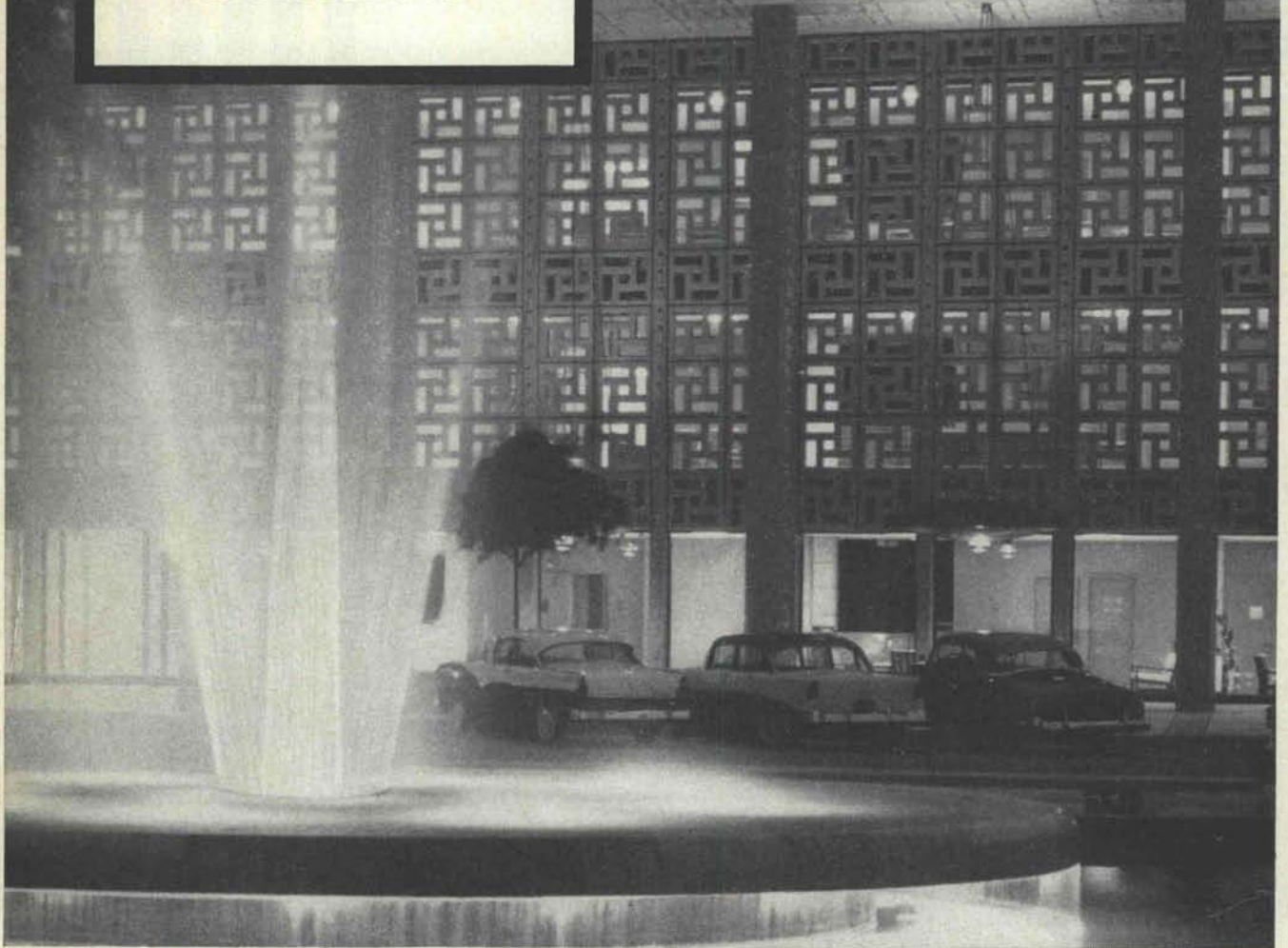
Stanford University Medical Center, Palo Alto, Calif. Architect: Edward D. Stone, New York. Structural Engineers: Pregnoff & Matheu, San Francisco, Calif.

The best ideas are more exciting in concrete