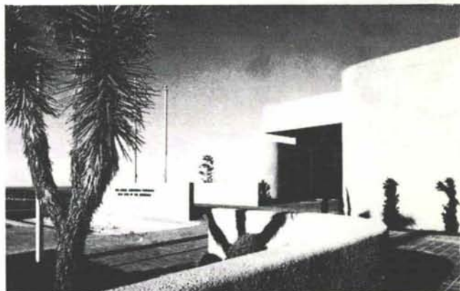
N. M. ZOOLOGICAL-BOTANICAL STATE PARK OF THE SOUTHWEST

KEYSON APPLIED COATINGS, Inc. 502 General Patch, S. E., Phone 298-7597 ALBUQUERQUE, NEW MEXICO 87112