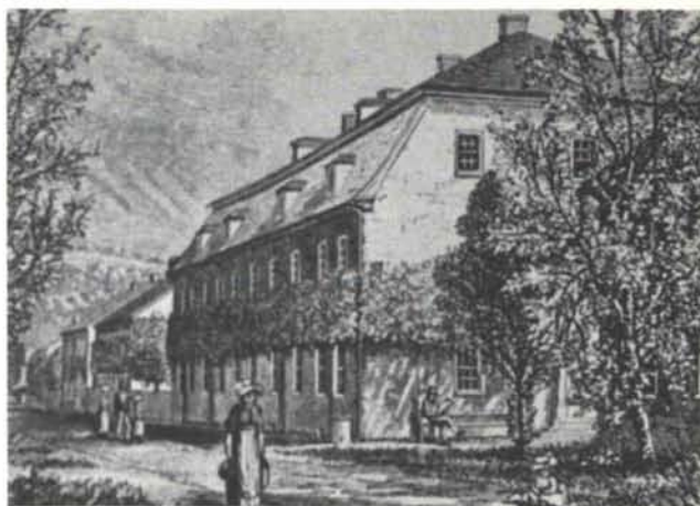
Assembly Hall at Economy, Penn. Founded in the mid-1820's by the Harmonists on the banks of the Ohio River 20 miles north of Pittsburgh.

HISTORICAL BACKGROUND. The view that communes are institutions comprising a rebellion against society, or are a "counter culture," is not quite accurate. Instead, they are both stimuli and reflections of the society in which they grew. Utopian thought has been a recurrent phenomenon since Plato, and literary utopias reflect the major trends of the thought of the day. During certain periods in history