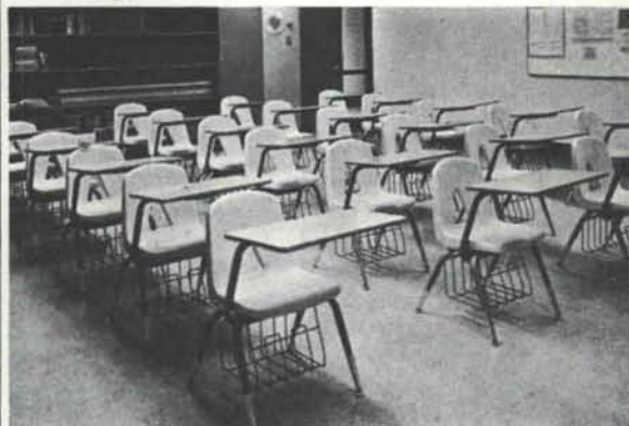
Exclusive distributor for Griggs Equipment, Inc.