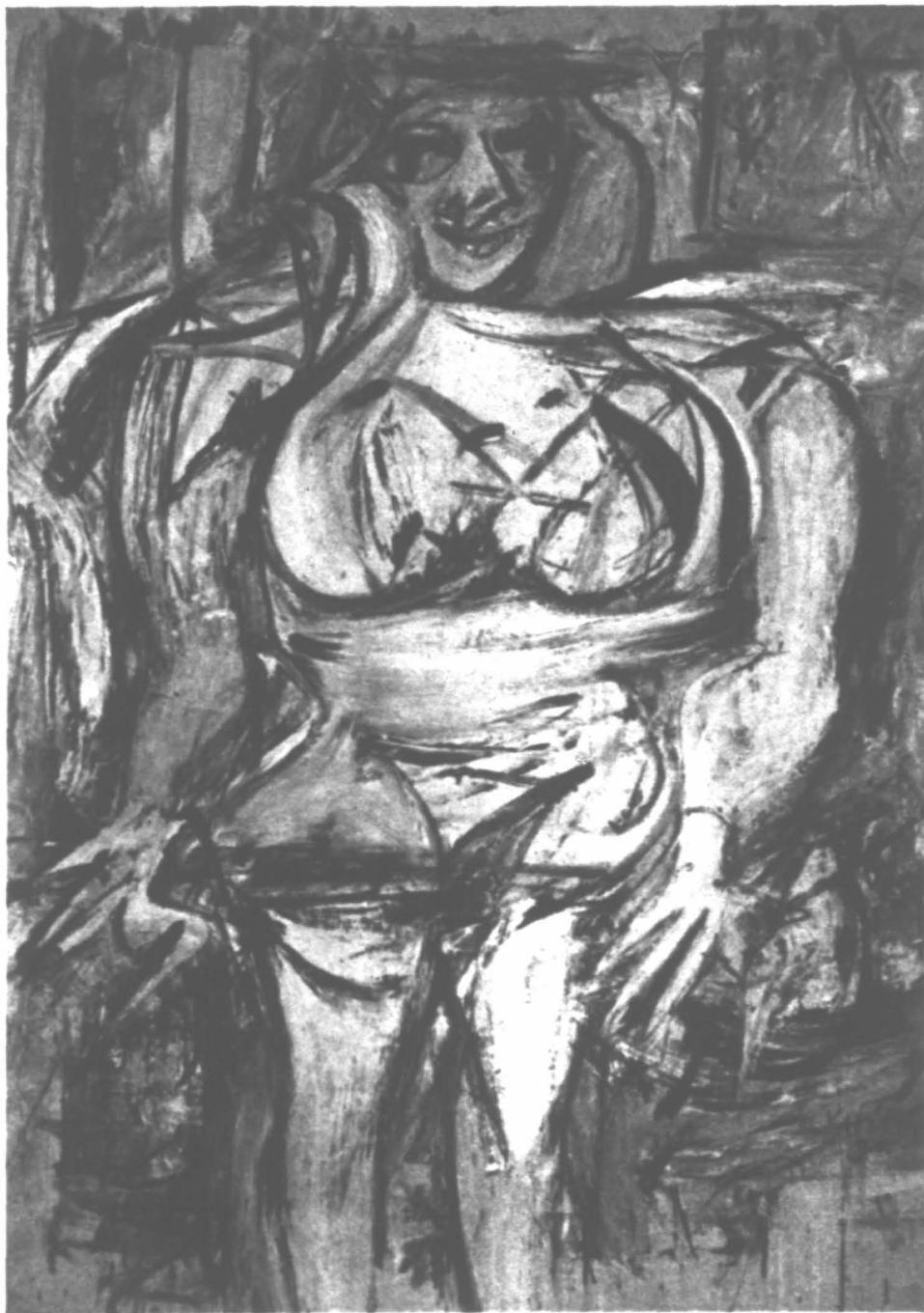
W O M A N II. Oil. Sidney Janis Gallery.