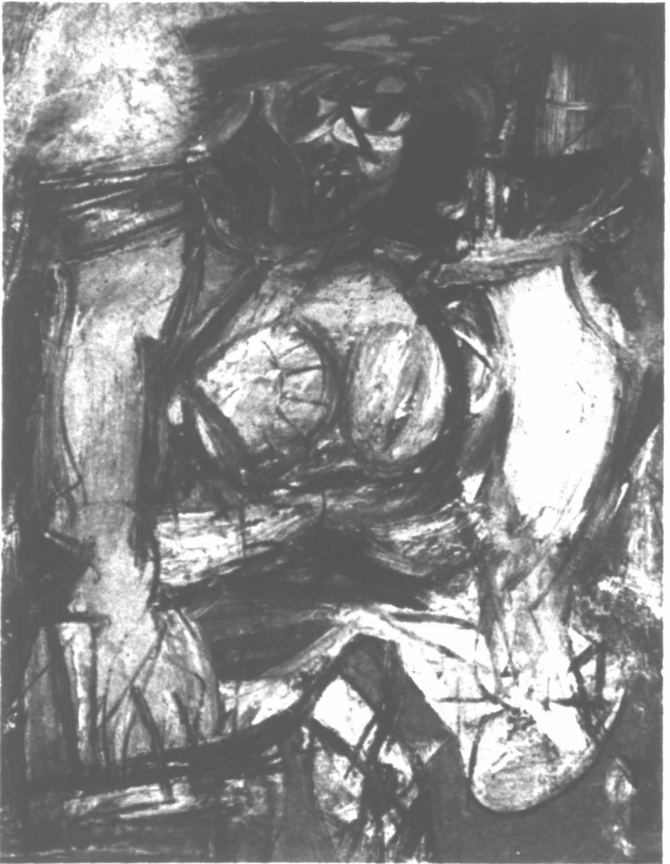
WOMAN IV, Oil, Sidney Janis Gallery.