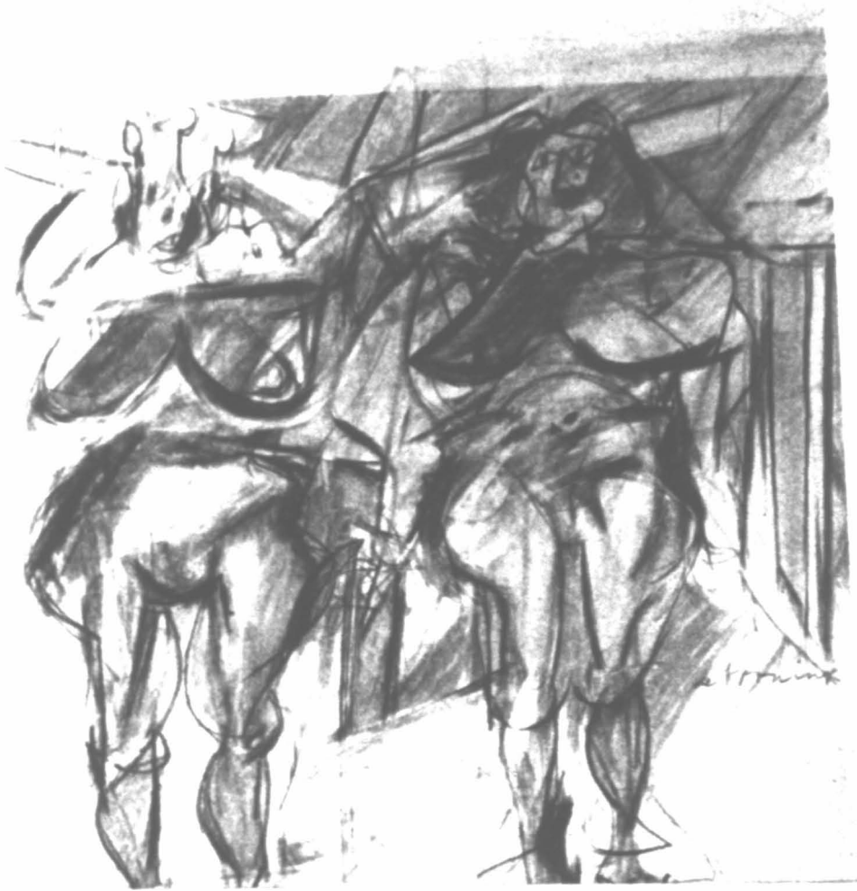
TWO WOMEN I. Pastel. Sidney Janis Gallery.