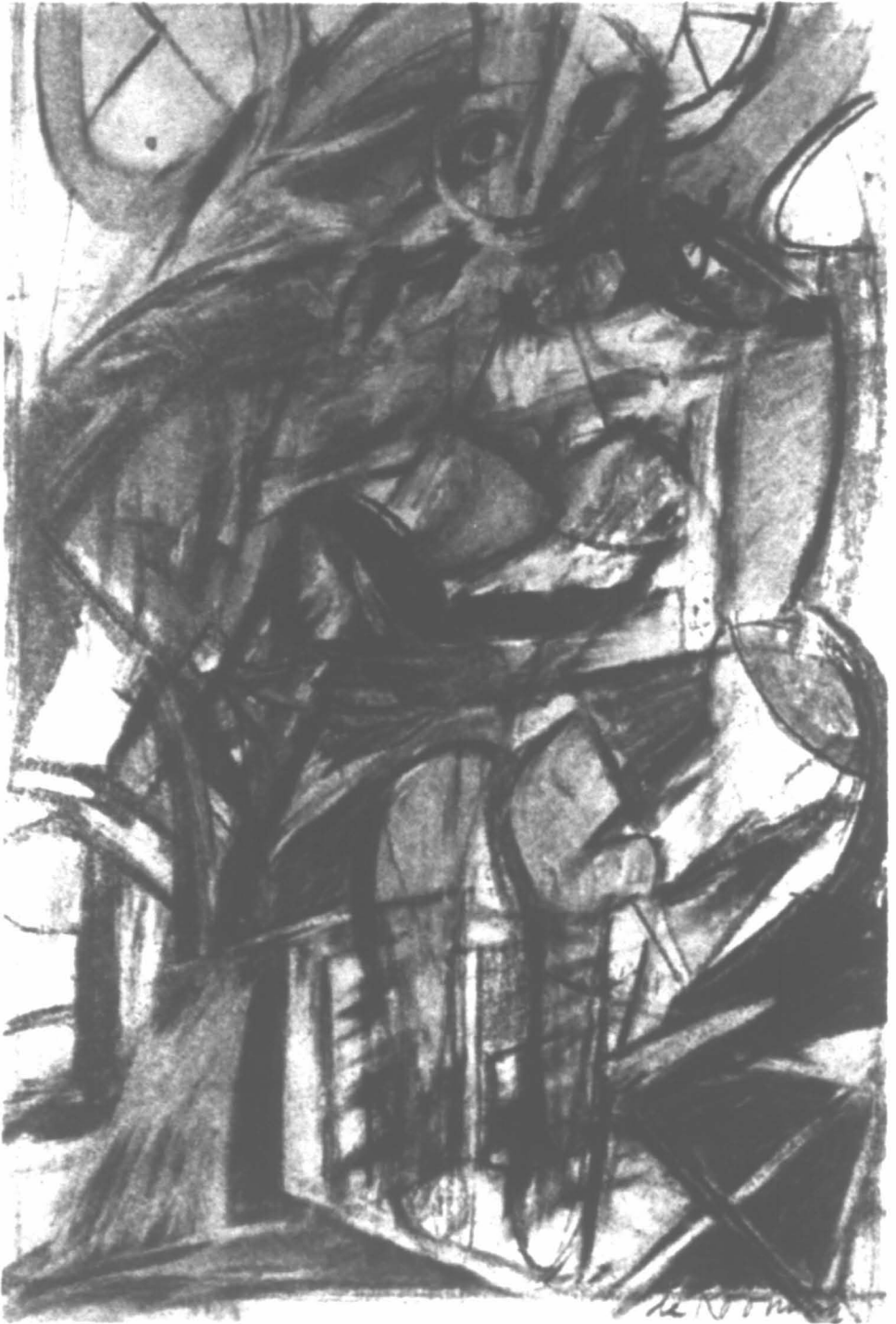
WOMAN SEATED I. Pastel. Sidney Janis Gallery.