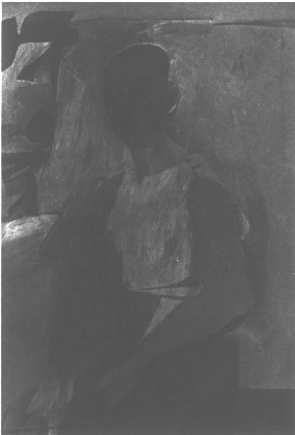
YOUNG TUMBLER. Oil.