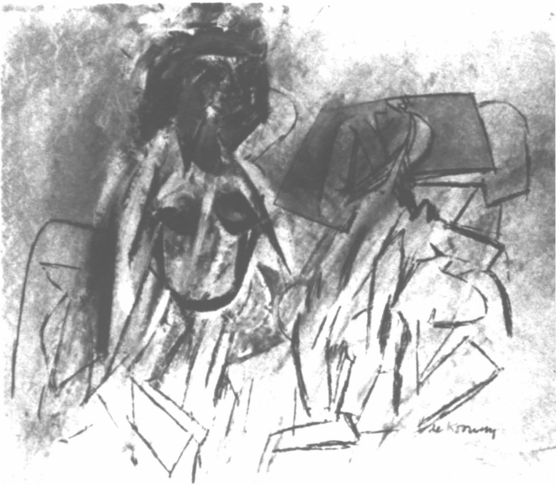
WOMAN AND ABSTRACT FIGURE. Pastel. Sidney Janis Gallery.