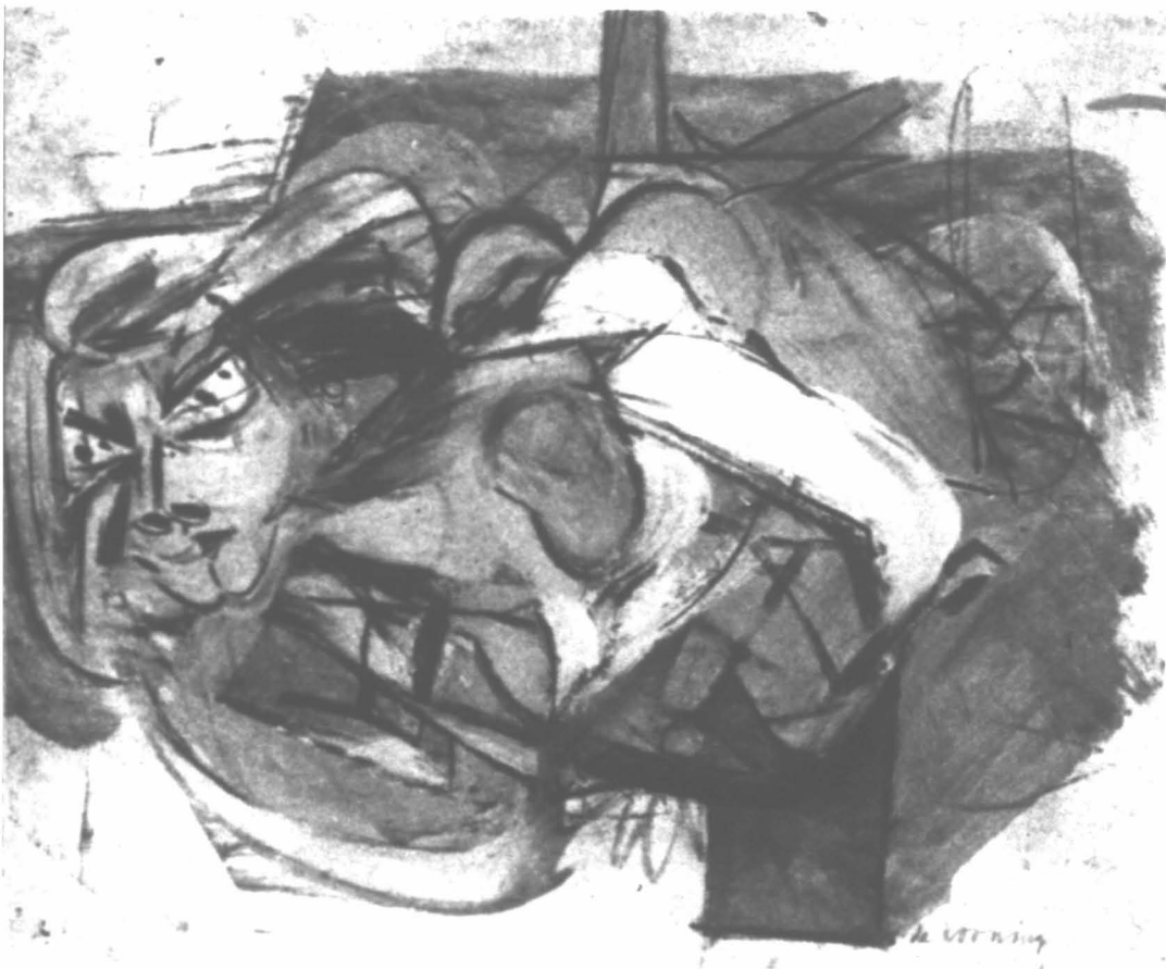
RECLINING WOMAN. Pastel. Sidney Janis Gallery.