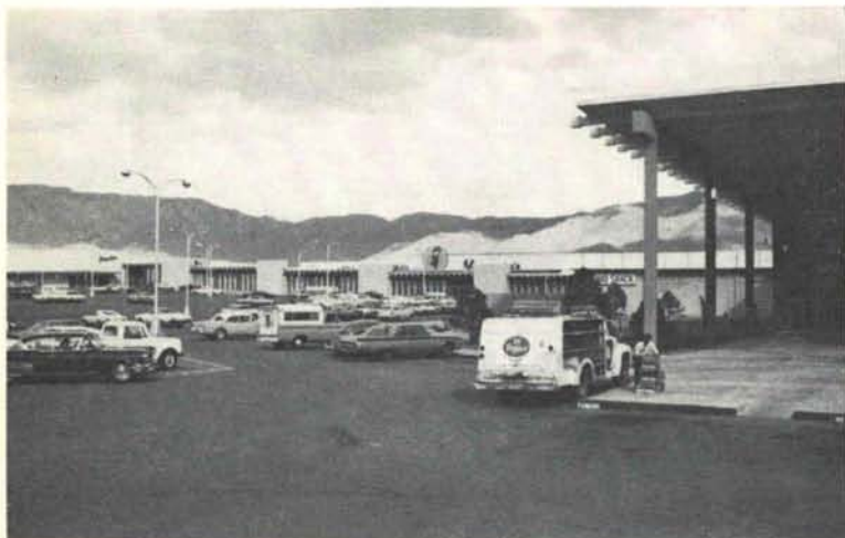
ARCHITECTS—FLATOW-MOORE-BRYAN AND FAIRBURN CONTRACTOR—LEMBKE CONSTRUCTION CO.

ENCLOSING OF THE PROMENADE SECTIONS OF THE MALL SHOPPING CENTER IN ALBUQUERQUE WAS EFFICIENTLY ACCOMPLISHED WITH PRESTRESSED CONCRETE DOUBLE TEE ROOF AND PRECAST CONCRETE SUPPORTING BEAMS AND MODIFIED DOUBLE TEE WALL SECTIONS, ALL CUSTOM MANUFACTURED BY PRESTRESSED CONCRETE PRODUCTS, INC.