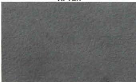
TROWEL & FLOAT