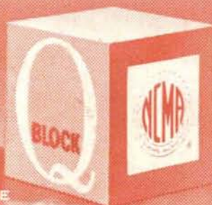
*A NEW NATIONAL STANDARD OF EXCELLENCE

EDGAR D. OTTO & SON, INC. WAS NEW MEXICO'S FIRST REGISTERED PRODUCER OF THE NATIONALLY RECOGNIZED "Q" BLOCK. OTTO QUALITY GOES BEYOND "Q" BLOCK SPECIFICATIONS TO SUPPLY A CONCRETE MASONRY UNIT WORTHY OF CONSIDERATION IN ANY AND ALL CONSTRUCTION.