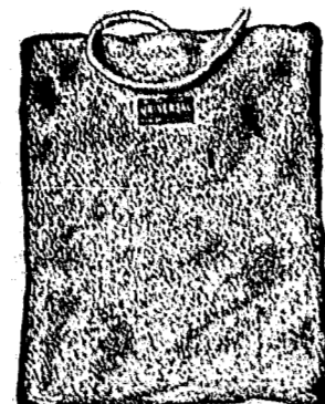
UNIVERSAL HOTPOINT OR Westinghouse

The most useful electric appliance the students can have, if there is an ache or pain simply apply the little silent bed-fellow and heat is the life that drives out the pain. Then when you come in late these evening after party or dance and your bed is cold, get and electric heating pad. Phone 98.