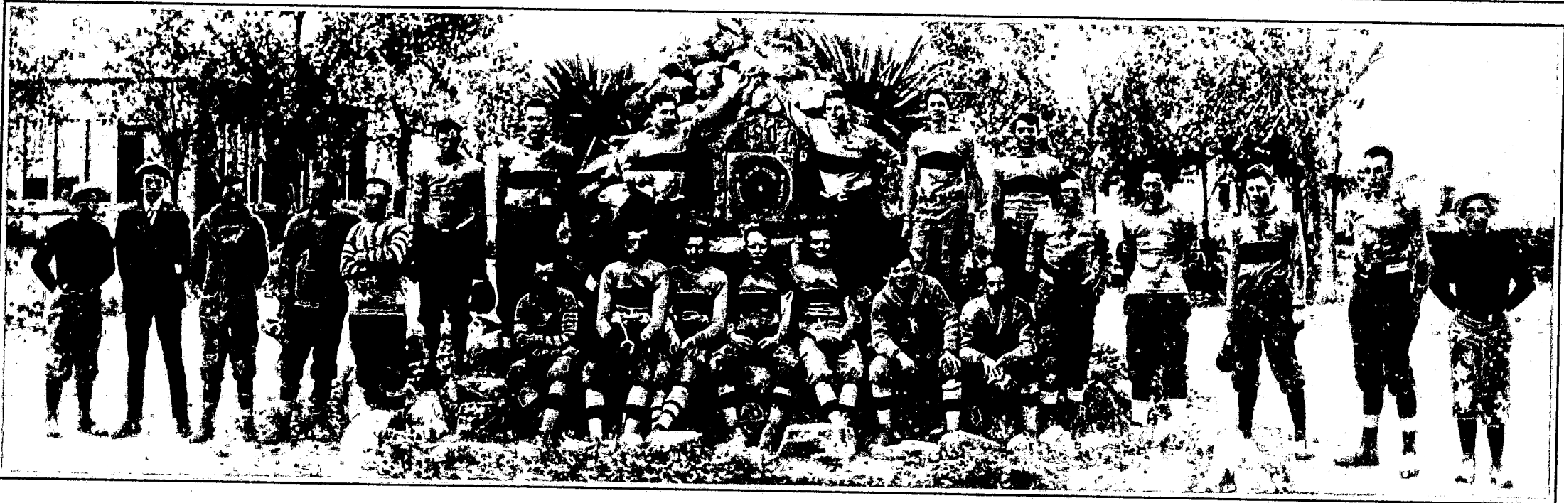
THE 1915 FOOTBALL SQUAD

A meeting of the University girls was held in Rodey Hall at four o'clock. Miss Dabb spoke interestingly. (Continued on page 2.)