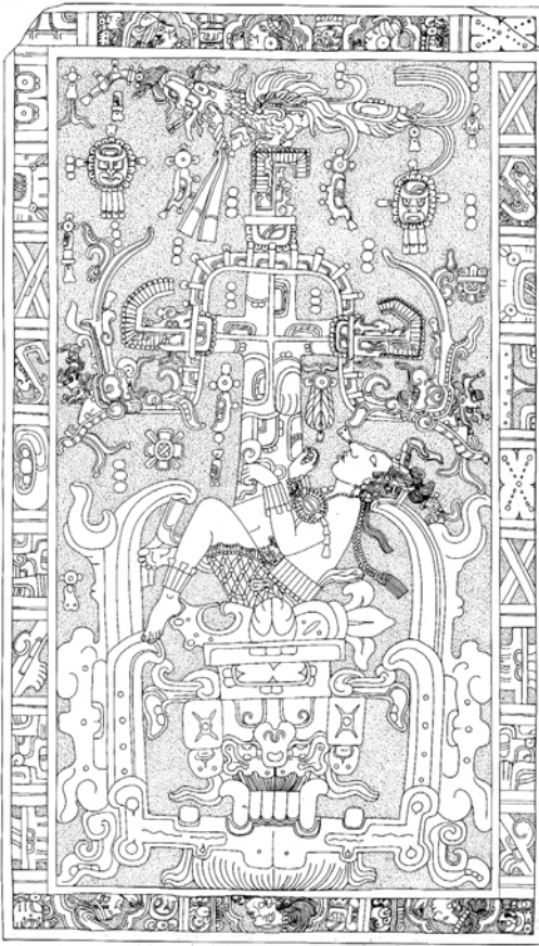
Figure 3. Drawing of Sarcophagus Cover. Tomb of Janaab' Pakal, Temple of the Inscriptions (C.E., 683). Drawing by Merle Greene Robertson (1975).

of the Temple of the Inscriptions as a whole, since its imagery depicts cycles of birth and new birth. A comparison of the sculptures from the piers and the imagery carved on the sarcophagus cover reveals an unexpected feature shared by both programs. Prominently depicted and central to the iconography of each work is a flexed, supine figure. The four pier sculptures present a reclining infant, whom Schele and Greene Robertson have identified as Pakal's son and heir, Kan B'alam. 30 Correspondingly, the cover of the stone sarcophagus portrays Pakal, the deceased ruler. 31 Both figures—the dead ruler and his infant son—are placed in identical poses. The self-reflexive (to echo or reflect in form and meaning) iconography of these images highlights a narrative of convergence