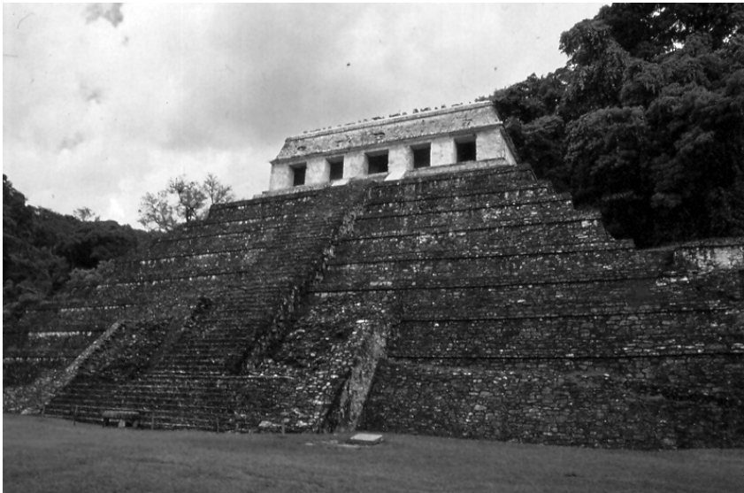
Figure 1. The Temple of the Inscriptions (ca. C. E. 683), Palenque, Chiapas, Mexico. Photo by author (July, 2003).

The Temple of the Inscriptions is a focal point in the urbanscape of Palenque (Figure 1). The temple, which would have been painted red in the seventh century, is composed of nine receding platforms, which culminate in a rectangular superstructure. 6 In line with many other indigenous architectural constructions, the lower sub-platforms of the temple correspond to the form of the mountain that abuts the South end of the temple. A broad staircase on the exterior of the central North-South axis of the temple connects these platforms with the superstructure and directs or leads the viewer's eye up along the nine tiers of the superimposed platforms. The stairs terminate at the base of the