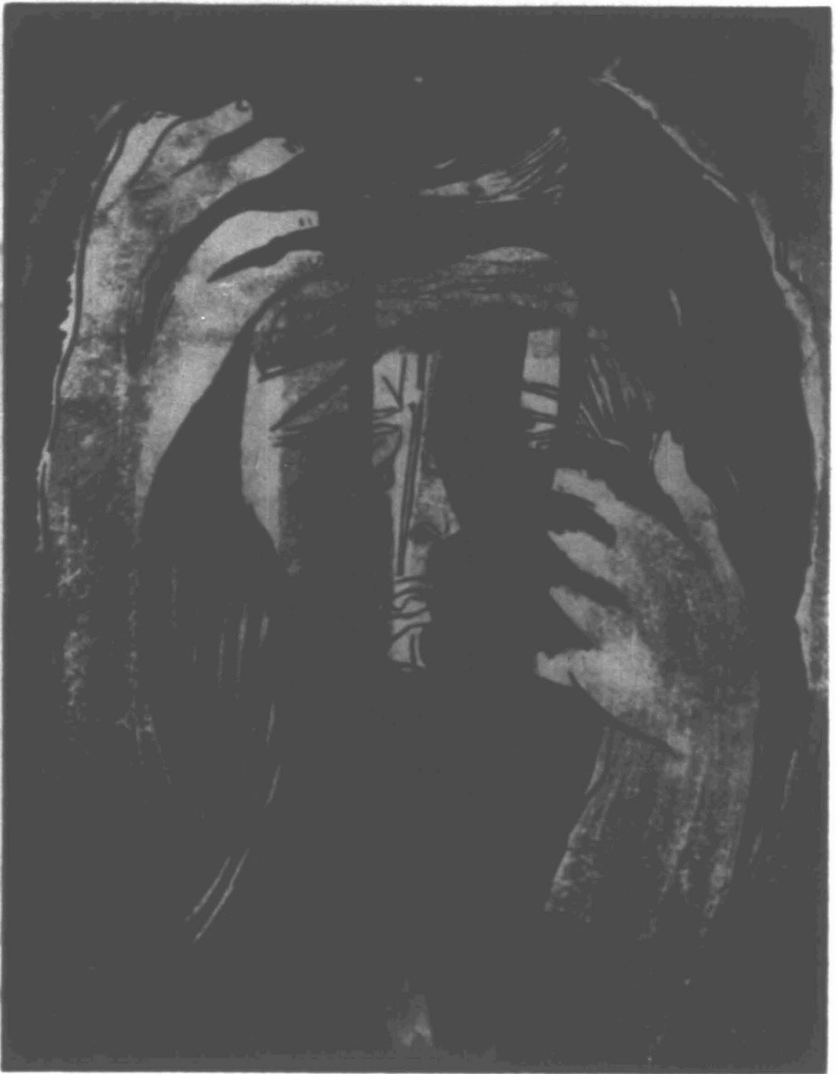
CRYING WOMAN. Colored woodblock print 18 \frac{1}{4} " x 25 \frac{3}{8} ". 1944.