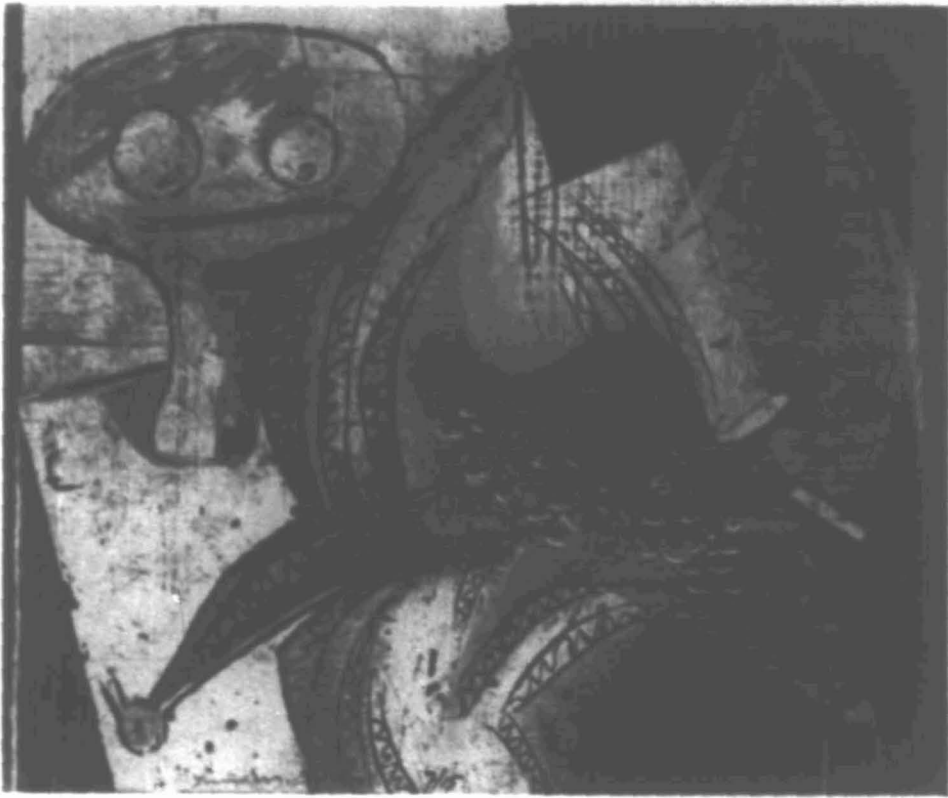
D E A D B I R D. Colored woodblock print 18 \frac{1}{4} " x 19 \frac{1}{4} ". 1947.