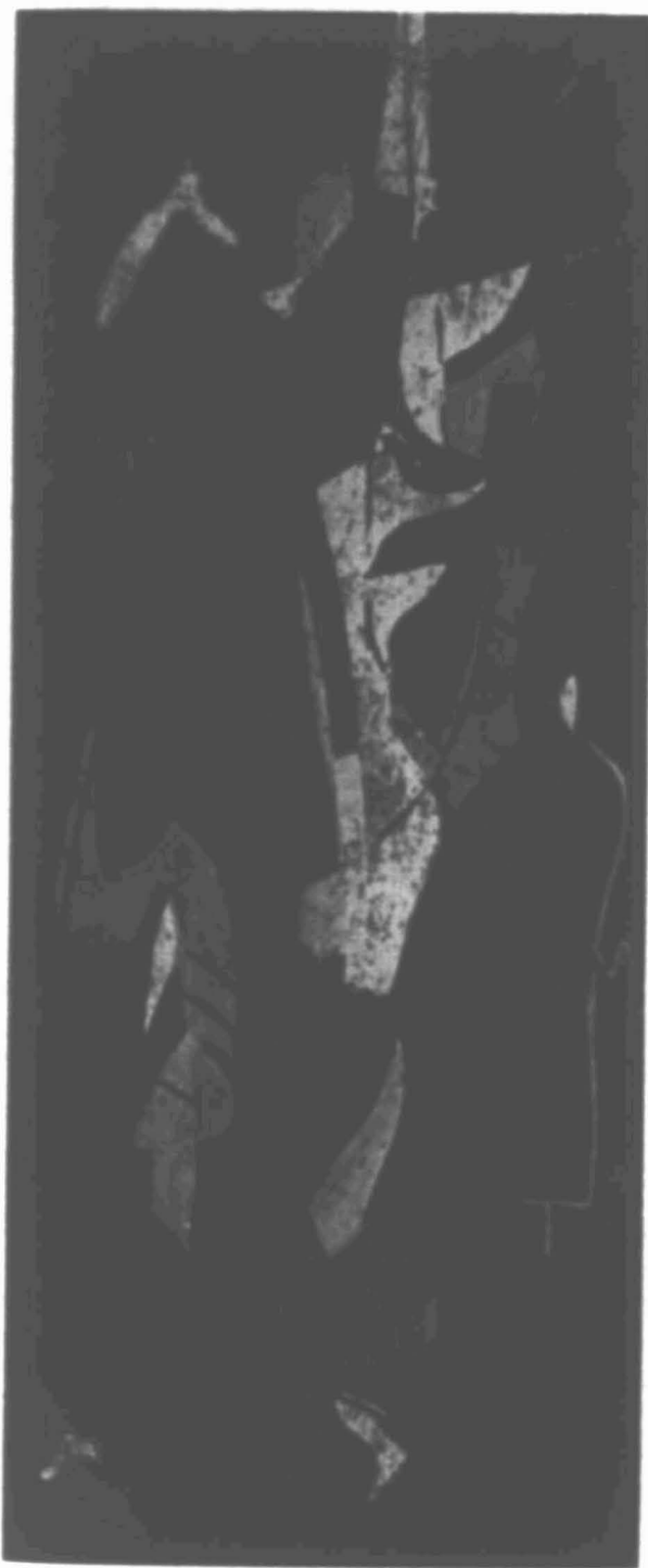
S U B U R B. Colored woodblock print 8½" x 23½". 1950.