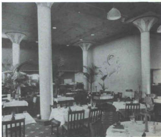
Wool Warehouse Theatre and Restaurant Boehning, Protz, Cook & Associates, P.A.