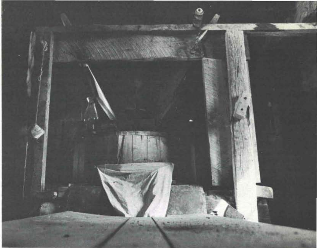
The Laureano Cordova Mill — interior . . .