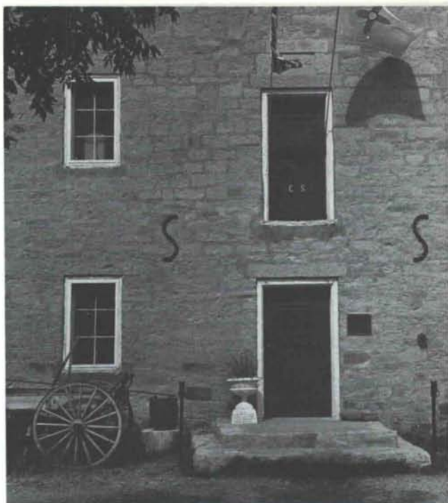
The Aztec Mill — exterior . . .