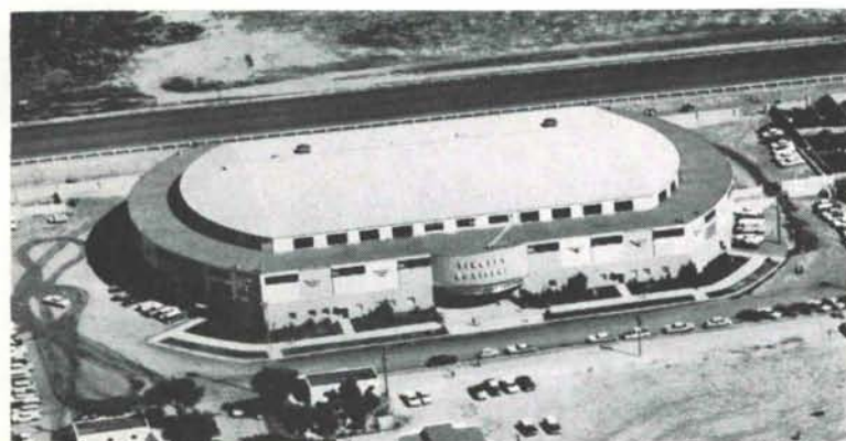
TINGLEY COLISEUM New Mexico State Fair Grounds

Bradbury and Stamm Construction Co., Contractors Brittelle - Ginner & Dekker, Assoc. Arch. - Eng. CREGO MASONRY UNITS USED THROUGHOUT