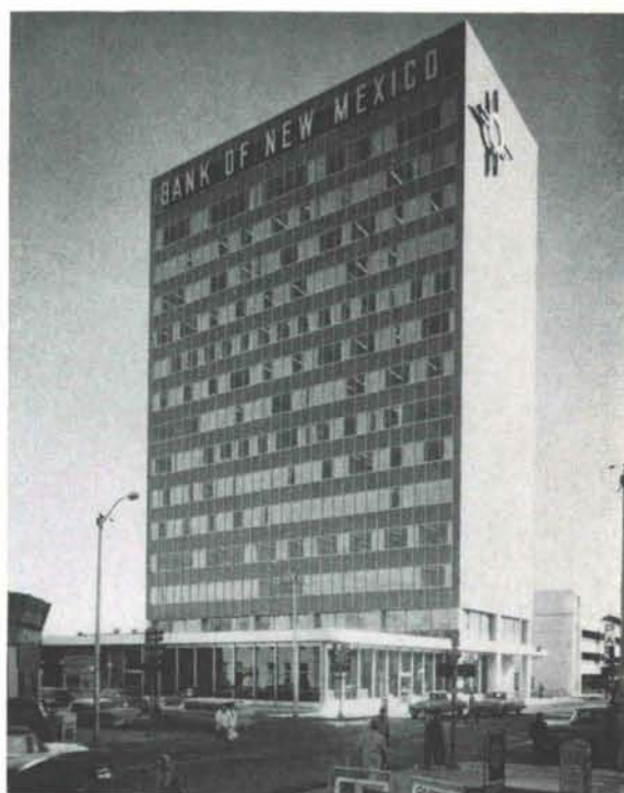
BANK OF NEW MEXICO Albuquerque, N. M.