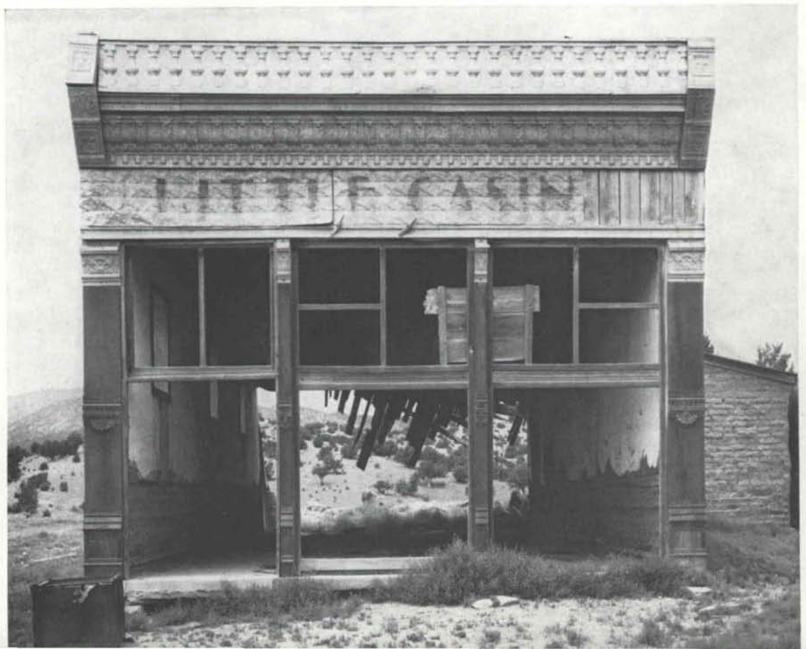
White Oaks