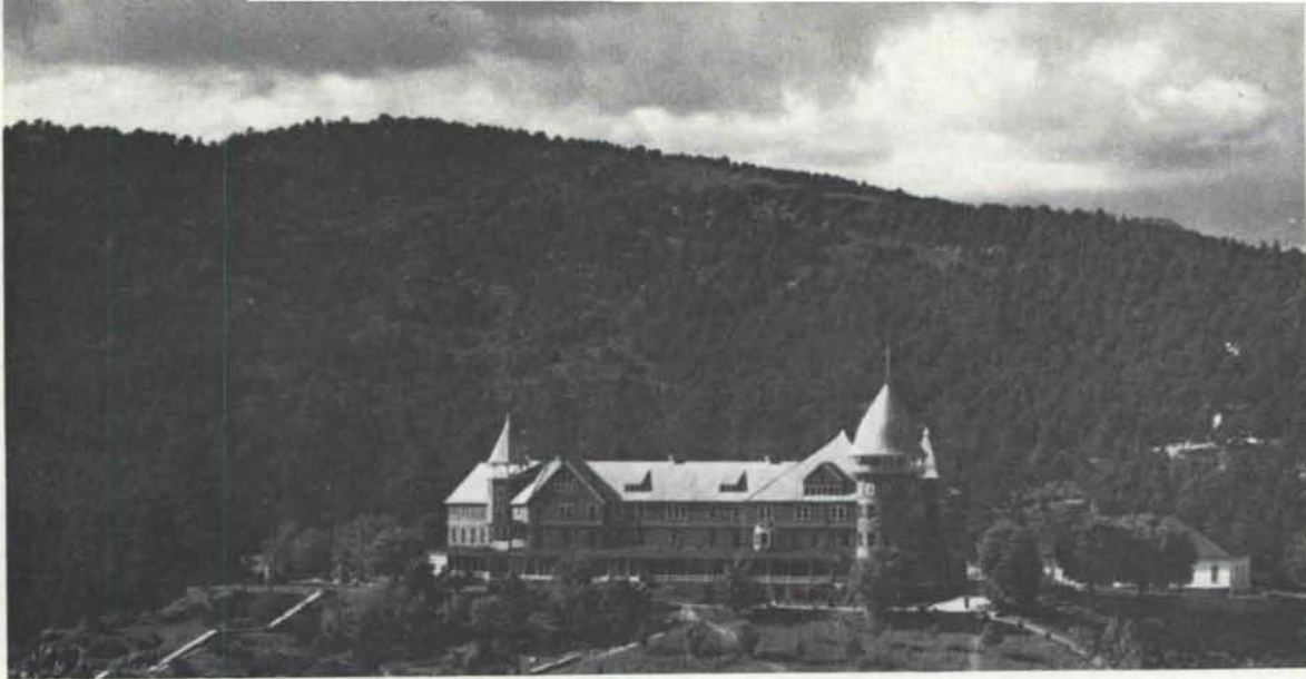
Montezuma Hotel, Montezuma