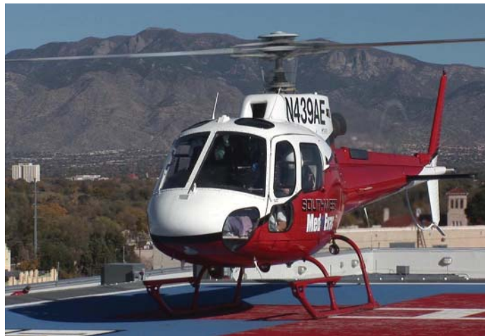
Air Ambulance Landing at Hospital