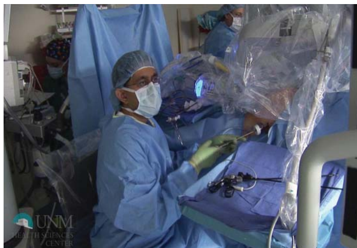
Robotic Surgery at UNM