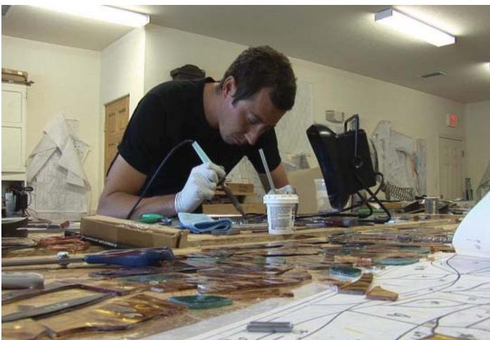
Creating the Tree of Life