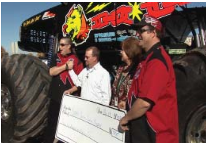
Monster Trucks Donation at Carrie Tingley