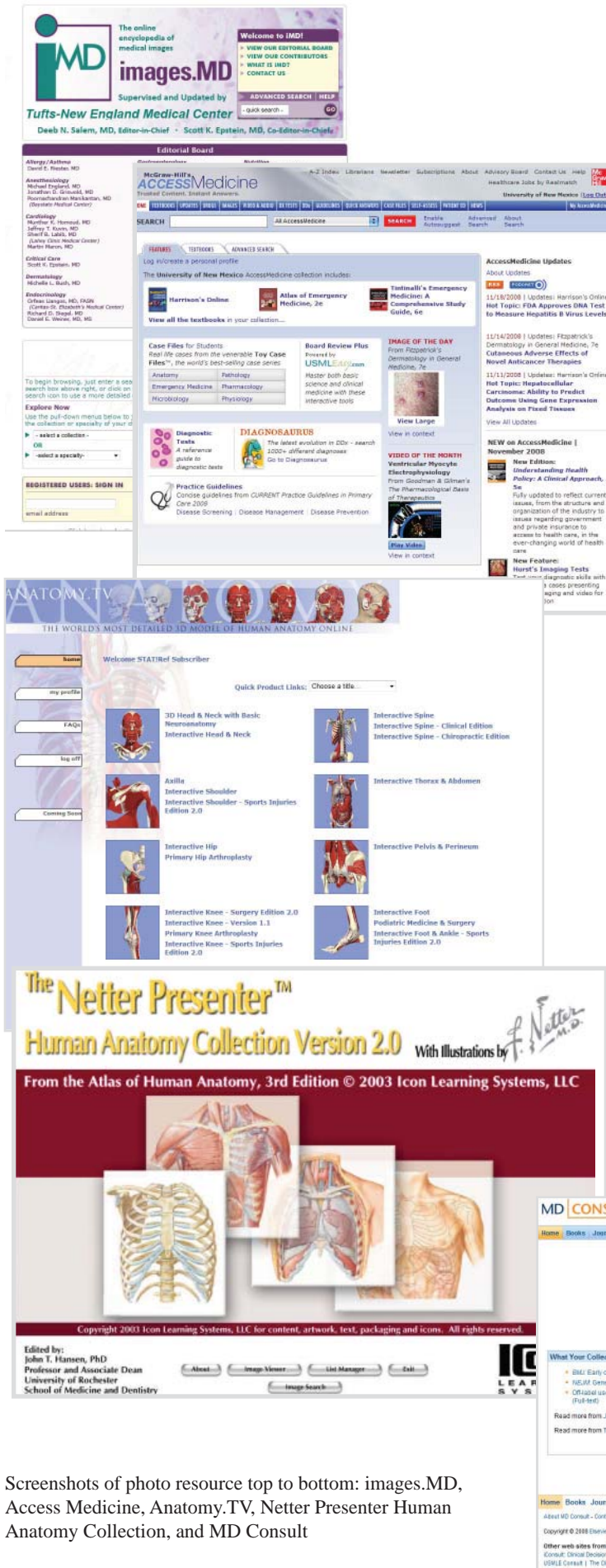
Screenshots of photo resource top to bottom: images.MD, Access Medicine, Anatomy.TV, Netter Presenter Human Anatomy Collection, and MD Consult