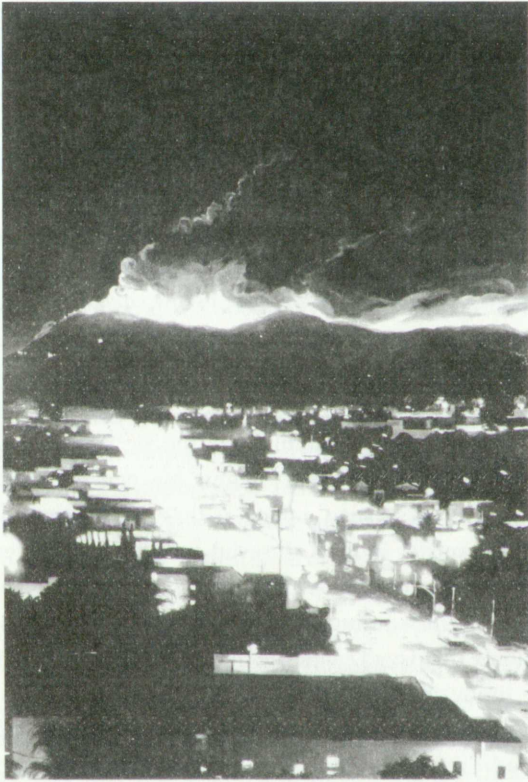
FIGURE 4. Vincent Valdez, BURNBABYBURN , 2009, detail, oil on canvas, 96 in x 144 in.

its gendered readings of the city. The femme fatale is one of the key figures in this genre. She is always portrayed as exquisite, ruthless and calculating—a combination of beauty, sensuality and cunning intelligence—unmatched by any other female character in the film.