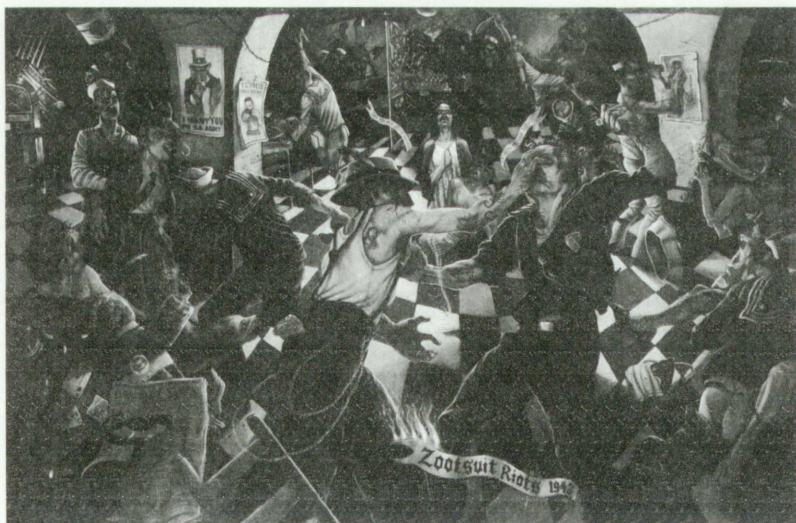
FIGURE 2. Vincent Valdez, Kill the Pachuco Bastard! , 2001, oil on canvas, 72 in x 48 in. Courtesy of the artist (Collection of Cheech Marin).

Dark, evocative, and erotic qualities characterize the work of this San Antonio-native. Valdez was catapulted into national prominence with his tour de force painting Kill the Pachuco Bastard! (2001) (Figure 2). Now part of the Cheech Marin collection, the painting toured the country in Chicano Visions (2002), a ten-city traveling exhibition. 4 After moving to Los Angeles in 2005, Valdez began work on one of his most ambitious commissions to date: El Chávez Ravine (2005–07) (Figure 3). Musical magnate Ry Cooder commissioned the artist to paint the history of Chávez Ravine, a Mexican American working class neighborhood that was systematically razed and then became home of Dodger Stadium. Valdez spent two years narrating this history through a fusion of film-like sequences, painted in oils on the body of a vintage 1953 Chevy ice cream truck with a mounted signboard.