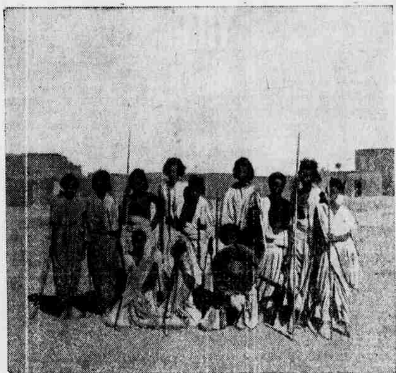
OXEN CAVALRY OF MADAGASCAR WITH PAWNEE BILL'S WILD WEST SHOW.

Subscribe for the Daily New Mexican and get the news.