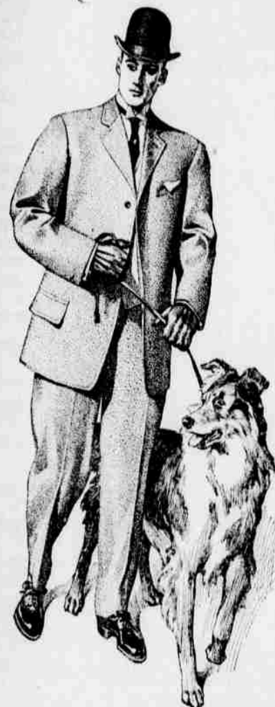
Copyright 1907 by Hart Schaffner & Marx

Your New Fall Clothes are ready for you now in our store and we are going to introduce them to you. You are invited; and when you come you'll meet a lot of the finest clothes you ever saw. These are the Hart Schaffner and Marx Clothes. The new suits are in a number of very Smart Models, and the Patterns are varied enough to suit every taste, Grays, Browns Tans, in stripes Plaids and Checks.