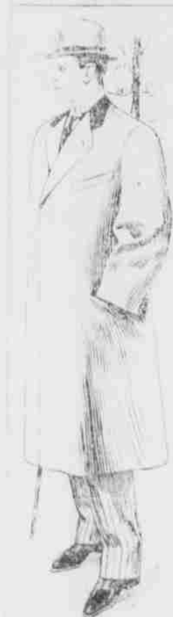
Washington Fashioned Apparel

Many a Man, when looking for a Suit, Overcoat or pair of Trousers, exclaims, after we have shown him a few garments.