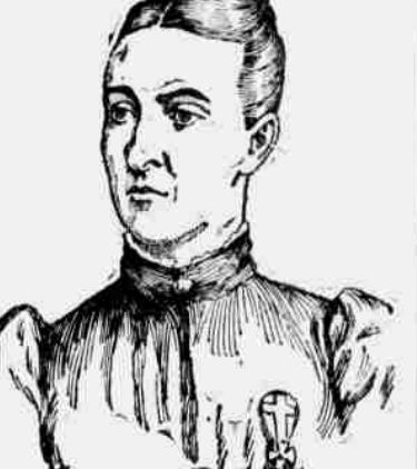
MRS. MARY LEASE.

The Woman Orator Who Stirs the Souls of the Farmer's Alliance.