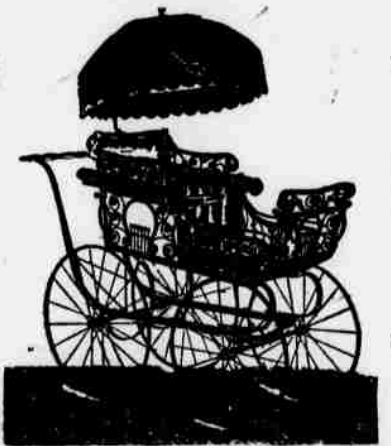
A FINE LOT OF NEW BABY CARRIAGES.