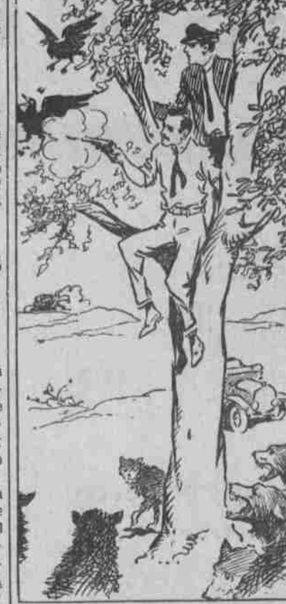
Shot One of the Crows.

They were cut off from their car. They were armed with revolvers; but the coyotes were too numerous to start a fight. A hickory tree was near.