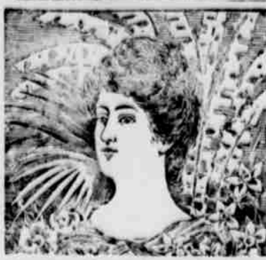
AN EXCELLENT COMBINATION.

The pleasant method and beneficial effects of the well known remedy, Strychnine, manufactured by the California Fig Syrup Co., illustrate the value of obtaining the liquid laxative principles of plants known to be medicinal laxative and preventing them in the form most refreshing to the taste and acceptable to the system. It is the one perfect strengthening laxative, cleanses the bowels effectively, dispelling colds, headaches and fevers gently yet promptly and enabling one to overcome habitual constipation permanently. Its perfect freedom from every objectionable quality and substance, and its acting on the kidneys, liver and bowels, without irritating or disturbing them, make it the best laxative.