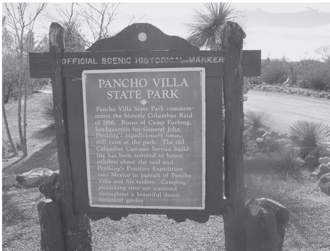
Figure 4. Pancho Villa State Park Historic Marker.

despite advertisements of the area's lush agricultural potential. Last, Villa's raid on the village shattered attempts to equate the U.S. military presence with the guarantee of safety. The U.S. Army's repulse of Villa's force was bloody and successful, but the battle irreparably damaged Columbus's public image.