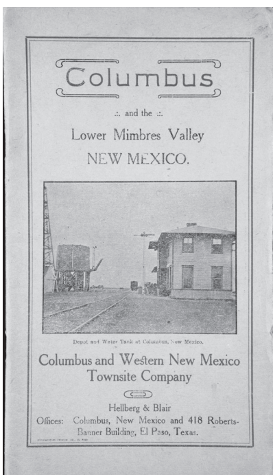
Figure 2. Pamphlet Cover (Depot). Cover of Townsite Company's booster pamphlet, circulated in 1912 to promote Columbus.