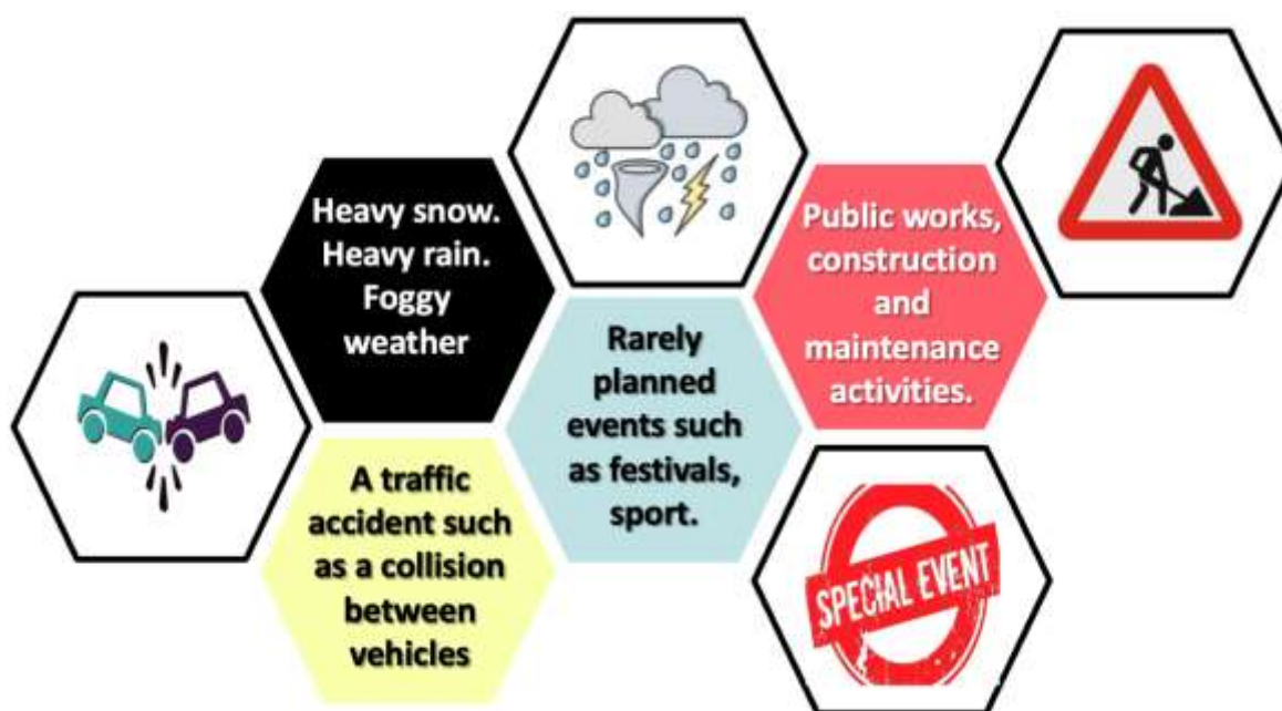
Figure 1: Non-recurrent traffic congestion sources.

The forthcoming part of the study is arranged as follows. In Section 2, an introduction of the basic concepts that we focus on in this paper is provided. In Section 3, some of the available methods in the scientific literature that tackle road traffic problems based on the Neutrosophic sets are presented. In Section 4, a comparative analysis is provided for the different presented methods. Finally, section 5, introduces the main challenges and future perspectives and concludes our brief review.