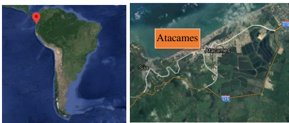
Figure 1. Region under study.

The Atacames region is located along a tectonic fault with high seismic activity. Due to this, in the earthquake that occurred on April 16, 2016, Atacames was among the cantons with the greatest impact along with Muisne. It is the fourth largest and most populated city in the Esmeraldas Province with approximately sixteen thousand (16 000) inhabitants. Having an excellent economic level due to its tourist development and having one of the largest beaches in Ecuador. Due to this, a large number of attracted people remain in the territory. Which presupposes a greater number of people exposed to the risk of suffering the adverse consequences of an earthquake.