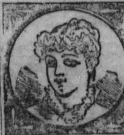
Ripans Tablets cure bad breath.