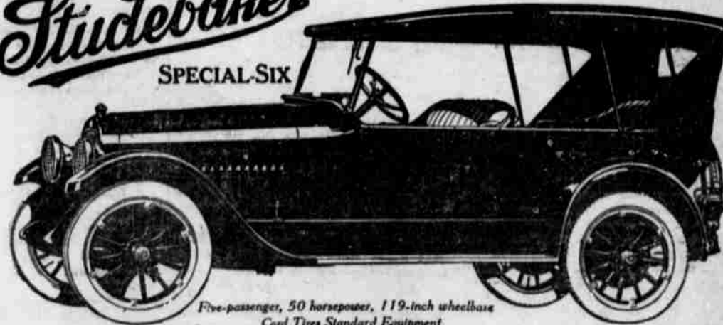
Five-passenger, 50 horsepower, 119-inch wheelbase Cord Tires Standard Equipment

Talk to a SPECIAL-SIX owner and note his enthusiasm. Examine the car and you will see the reason. The SPECIAL-SIX possesses the qualities that make up true motor car value.