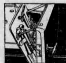
Locked tool compartment in left front door

There is comfort: genuine leather upholstered cushions, nine inches deep, and long semi-elliptic springs, front and rear. Leg room,