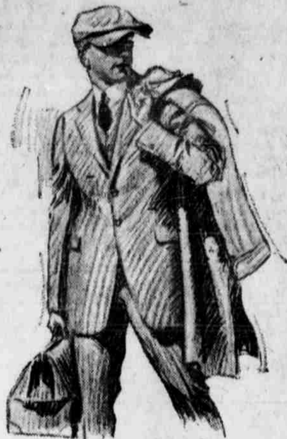
Copyright 1922 Hart Schaffner & Marx