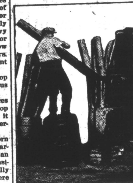
Removing Posts After Treatment in Creosote—The Posts Are Allowed to Drain in the Barrels.

This tank is mounted about a foot from the ground on a brick foundation, which contains a firebox. Wood is used for fuel. If the posts are to be