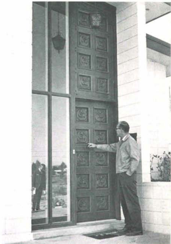
The hand-carved front door with matching overhead panel of the Aycock residence.