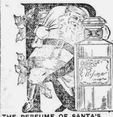
THE PERFUME OF SANTA'S MEMORY

If you want anything on earth—try a New Mexican Want Ad.