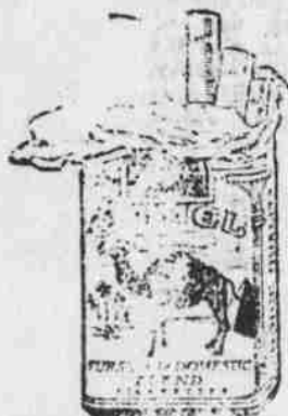
R. J. REYNOLDS TOBACCO CO. Winston-Salem, N. C.

But it doesn't take an expert to tell Camel quality. You'll spot it the very first puff. Try Camels yourself.