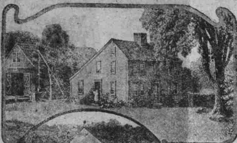
Birthplace and childhood home of Mary Baker Eddy, Bow, near Concord, New Hampshire.