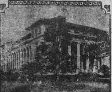
University of the Philippines, which has an enrollment of 3,500 students.

"The Filipino boys and girls are well balanced, docile and industrious