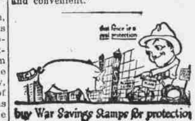
Buy War Savings Stamps for protection