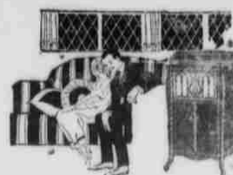
STARR PHONOGRAPHS The Phonograph with a Singing Throat

We carry a complete line of PIANOS PLAYER PIANOS PHONOGRAPHS Sheet Music Records, Rolls, Small Instruments, Supplies