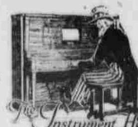
Instrument He was Born to Play BALDWIN MADE PIANOS

We carry a complete line of PIANOS PLAYER PIANOS PHONOGRAPHS Sheet Music Records, Rolls, Small Instruments, Supplies