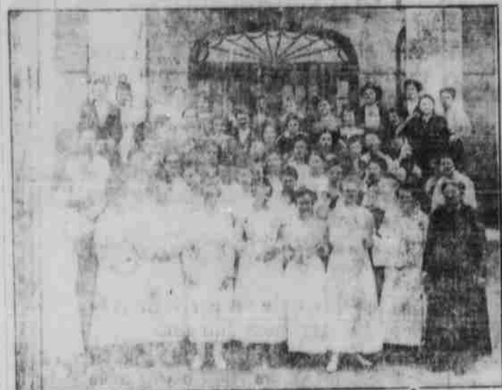
Group of Young Women Volunteers Preparing Themselves for Special Christian Service at Baptist Training School, Fort Worth, Texas.

Southern Baptists Will Have Ample Working Force for New Program—Campaign Hopes to Strengthen Local Churches and Win 2,000,000 Lost to Christ During Next Five Years.