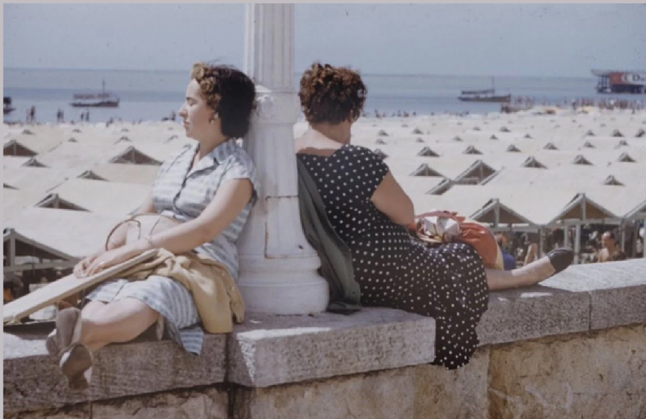
MAR DEL PLATA, ARGENTINA, 1958.