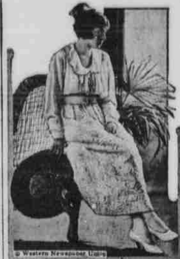
An organdie embroidered summer skirt with a flesh georgette blouse with Val lace. The hat is mauline with a robin's egg blue raffia crown—a fine summer outfit.

Jenny uses Chantilly lace in a large way, that is to say, in quantities and in big spaces. A black satin and