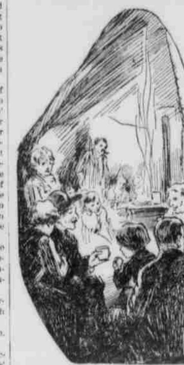
Savory Smells Soon Were Coming From Hot Frying Pans.

Savory smells soon were coming from hot frying pans, as sliced ham with bread and gravy, was served up in tin plates and passed about the