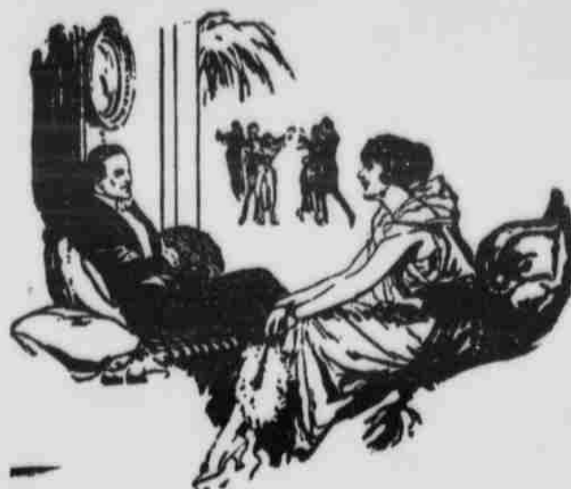
Copyright 1920 The House of Kuppenheimer

More shipments of Kuppenheimer Good Clothes have arrived