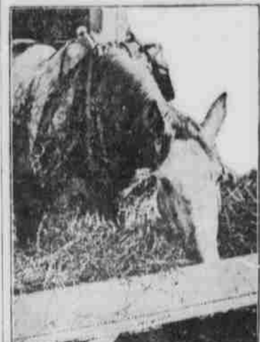
Proper Care Keeps Farm Animals Healthy.

Every year the people of the United States lose over $200,000,000 directly (and no one knows how much indirectly) through diseases of farm animals. This is a large toll when divided on a per capita basis, and when it comes home to the farm stock-raiser who finds a valuable animal dead in the barn, or an epidemic spreading into his herd, the loss is sometimes disastrous. The most regrettable feature