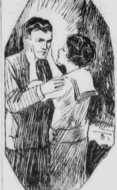
"You Are Not Thinking of Going to Manitoba?"

"No, not exactly that. Let us sit down and I will tell you what I