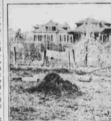
Don't Leave Manure in Piles Exposed to Weather Conditions Favorable to Loss By Washing—Use It to Make a Compost Heap.

If it is desired to add to the heap from time to time the top layer may be opened and the new material