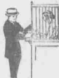
Copyright, 1921, A. B. Kirschbaum Company

It owes you that well-set-up, smartly-styled look. It owes you long wear. It owes you complete satisfaction and a full return for your money. Why take a chance of not getting these things when in Kirschbaum Clothes you are sure of them—or else of having your money paid back. Prices are twenty-five to forty-five dollars.