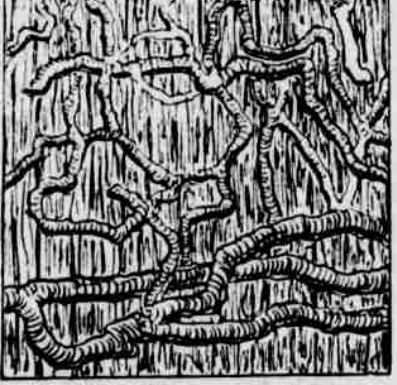
Work of Borers in Oak Bark.

The larger galleries found underneath the bark of the trees were made