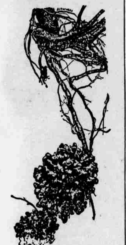
Roots of Velvet Bean, Showing Nodules.

The velvet bean is an important crop for the purpose of soil improvement, especially in cotton-growing territory.