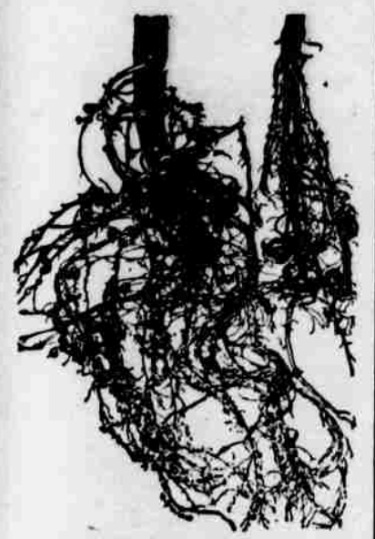
Roots of Soy Bean, Showing Nodules.

The soy bean, also known as Japan pea and soja bean, is one of the many good things that have come to us from Asia.