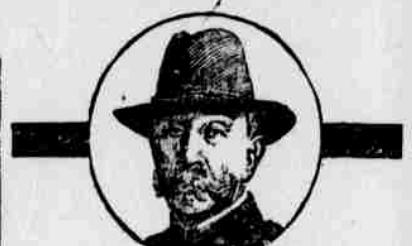
Walter Winans, Esq. The most famous shot in Europe with hand and shoulder arms.