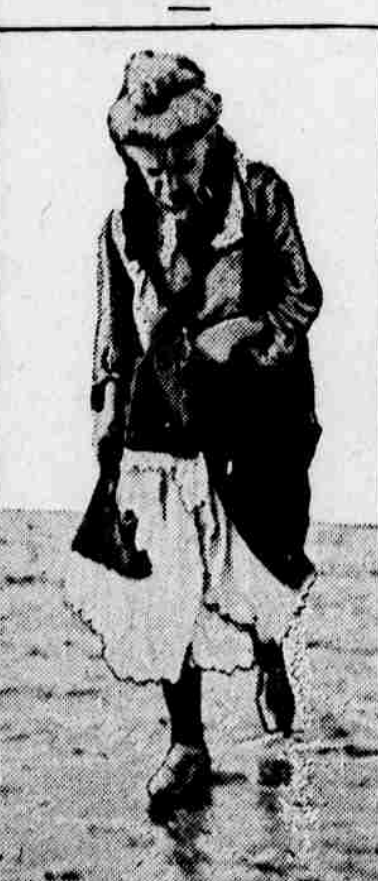
This aged woman remained in her cottage in the North of France until the German bombardment laid the village in ashes. She had to seek safety in the French lines. All her worldly possessions are lost.