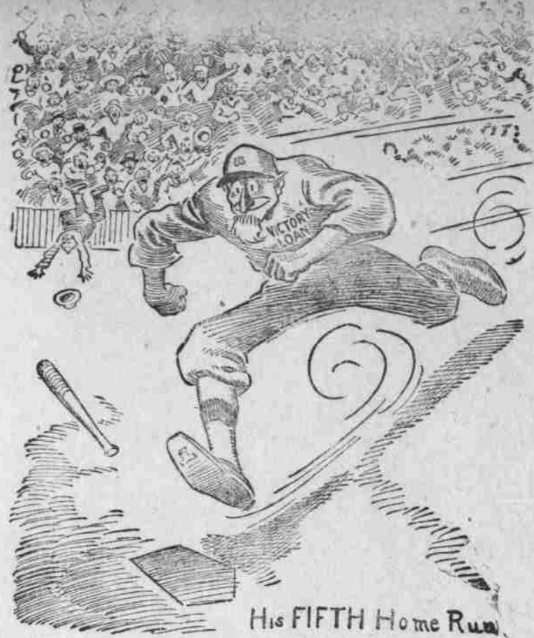
His FIFTH Home Run.