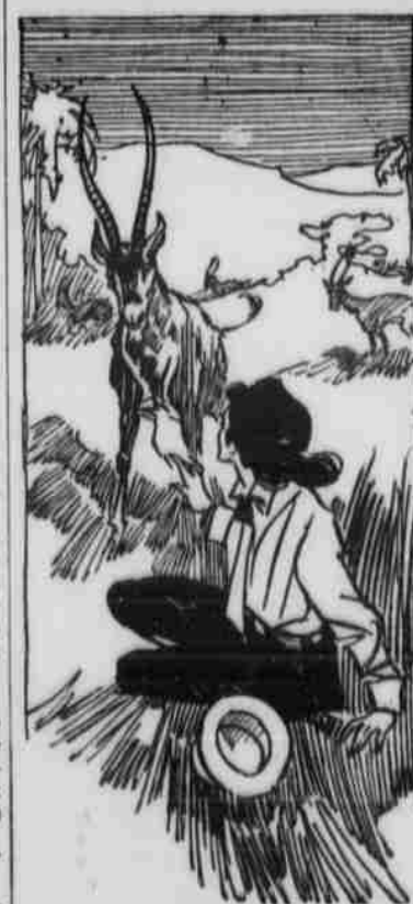
In His Eyes Was a Gleam Unbelievably Wicked.

He turned from her and plunged at right angles into the forest. She followed him into the chill air under the great trees. All too soon Andrea came out with him into a wide clearing