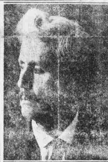
OCTAVIANO A. LARRAZOLO.

State may not be permanently and irreparably injured and set back.