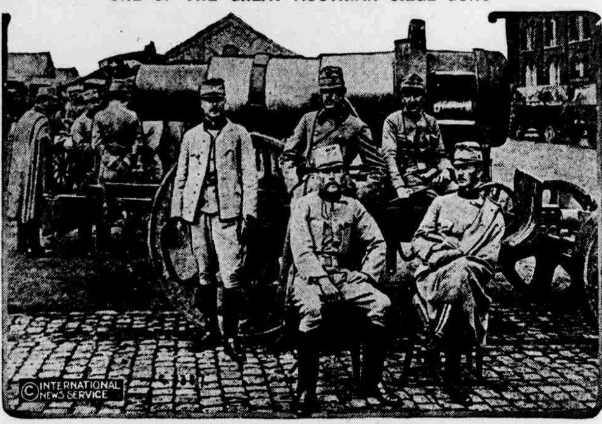
The Austrian army, as well as the German, is supplied with enormous siege guns, some of which were used in the siege of Antwerp. One of these heavy howitzers, with a group of Austrian officers, is here shown.