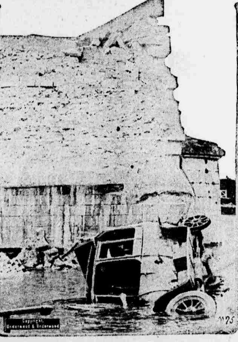
Pinned beneath the wreckage of this automobile were the bodies of a German captain and lieutenant, who were bearing dispatches to the commanding officer of the army of the Marne. When the car came to the bridge at Trilport, which the allies had destroyed, it was going so fast the officers could not save themselves.

Mr. Kalser Is Now Mr. King. London.-A German or Germansessor so unpopular both in a busi- senthal to Rodeny, Howitz to Howard, ness and a social way in London that Bruggemey to Bridges and Stohwasthere has been a rush of British-born | ser to Stowe. But the most tactful England to the courts for new names. ser for King.