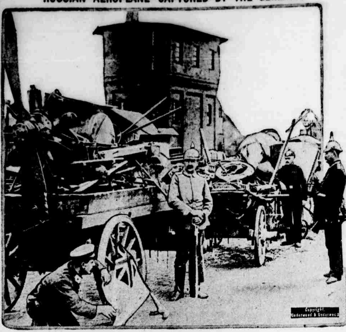
German transport removing a Russian aeroplane captured by General von Hindenburg at Lotzen. The engine was used later on a German aeroplane.